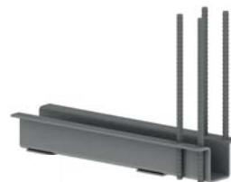
FIX-BRA Parapet Bracket