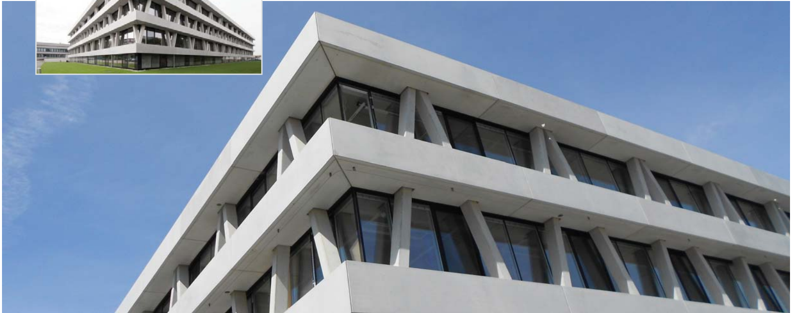
Centre for Technology & Design, St Pölten