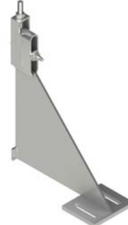
FIX-S Brickwork Support Bracket