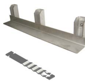
HMCS Brickwork Continuous Support