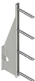
HMS-AW Restraint Channel