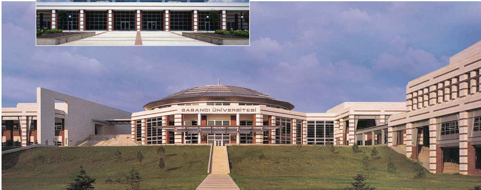
Sabanci University, Istanbul