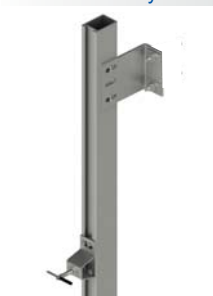
HMP-ALU-SP Sub Channel System