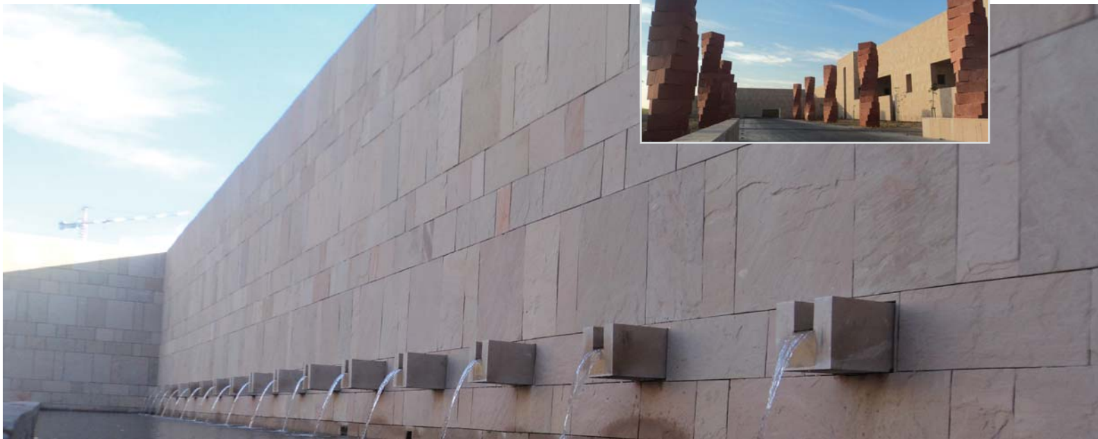
School of Foreign Affairs, Doha