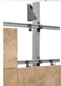
HMP-ALU-SP/H Sub Channel System