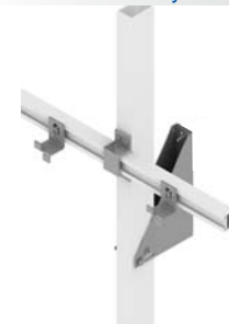
HMP-ALU-SP/HK Sub Channel System